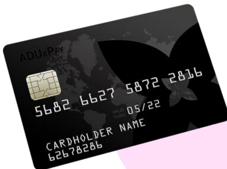
“ADUxPay Prepaid Card VIP”

The “ADUxPay Prepaid Card VIP” will be sent after 28 th February 2019.