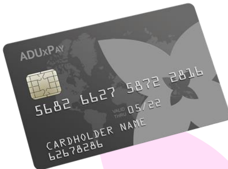
“ADUxPay Prepaid Card Classic”

The “ADUxPay Prepaid Card Classic” will be sent after 28 th February 2019.